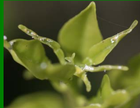
New citrus flush is twisted or burnt back

The psyllid is a carrier of the bacterial disease Huanglongbing (citrus greening disease). The psyllid feeds on citrus and closely related plants.