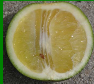
Lopsided, bitter, hard fruit with dark seeds