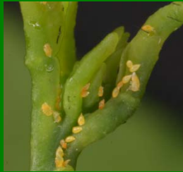
Eggs tucked inside new citrus flush