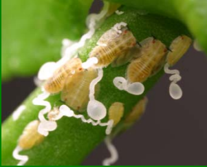
Young stages with waxy tubules