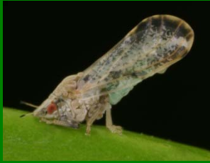
Adult psyllid -1/8 inch