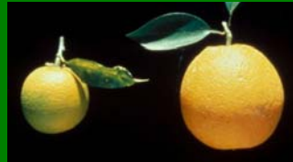
Diseased - Healthy